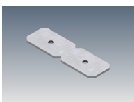
JN-ST Straight joiner