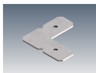
JN-90 90 degree joiner