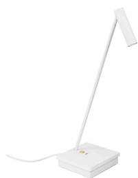
Table lamp E-lamp Wireless LED 2.2W 2700K White 141lm