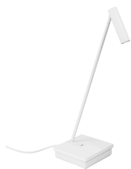
Table lamp E-lamp Wireless LED 2.2W 2700K White 141lm