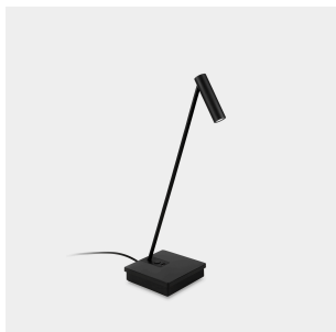
Table lamp E-lamp Wireless LED 2.2W 2700K Black 141lm